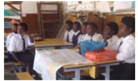
Beth's girls class in session

Automatic monthly payment option coming soon