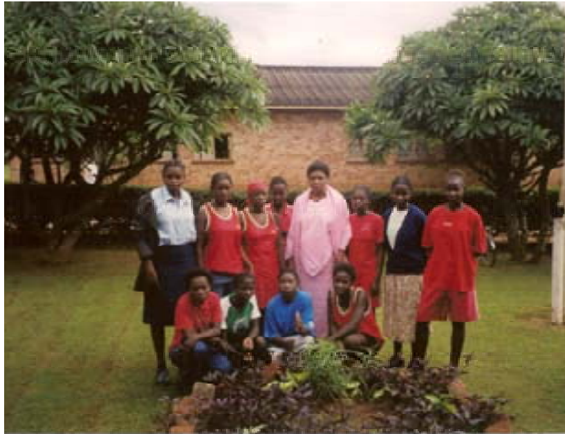
Beth's Girls juniors and seniors at Mwinilunga High School

Current figures show 41 girls in grade 8, 24 girls in grade 9, 6 girls in grade 10, 5 girls in grade 11, and 5 girls in grade 12, along with Prudence and Mary in college. Beth's Girls are most grateful for the scholarship opportunity. Priscovi Sangenjo, Grade 8, says "Education is