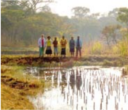
One of Beth's fish ponds