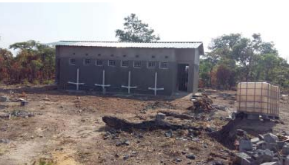
Ablution block (lavatory) for boys

During the first phase of this project, World Vision aims to construct a secondary school (six classrooms in two blocks), two preschool classrooms, and two houses for teachers.