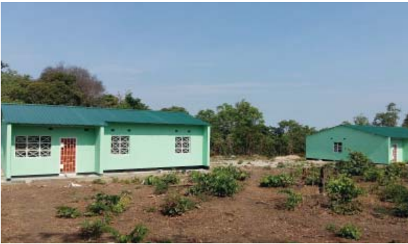
Houses for teachers