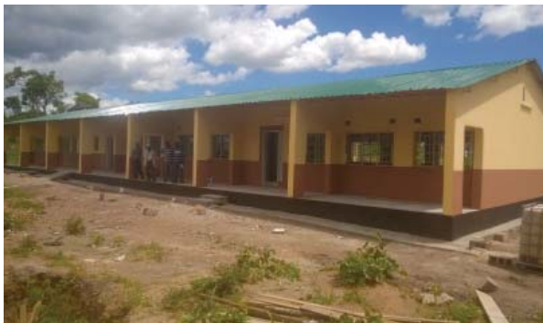
Secondary school classroom block